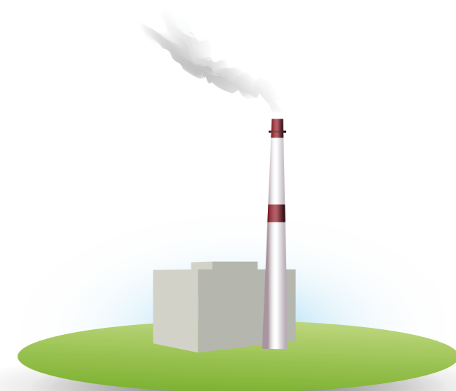
Release of gases