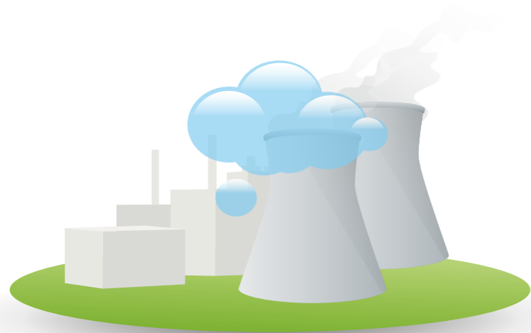
Nuclear power plant